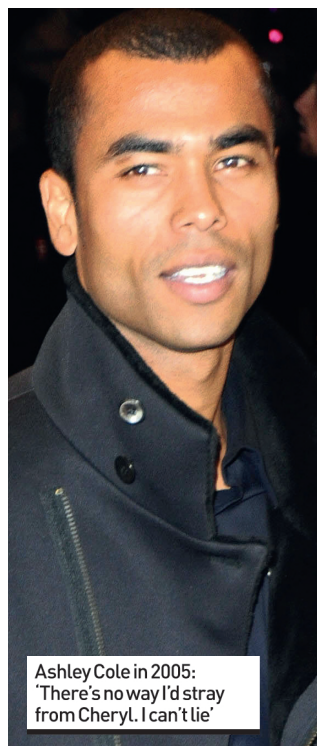
Ashley Cole in 2005: 'There's no way I'd stray from Cheryl. I can't lie'

“TIGER WOODS: I CONVINCED MYSELF THAT NORMAL RULES DIDN'T APPLY. I NEVER THOUGHT ABOUT WHO I WAS HURTING”