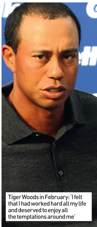
Tiger Woods in February: 'I felt that I had worked hard all my life and deserved to enjoy all the temptations around me'